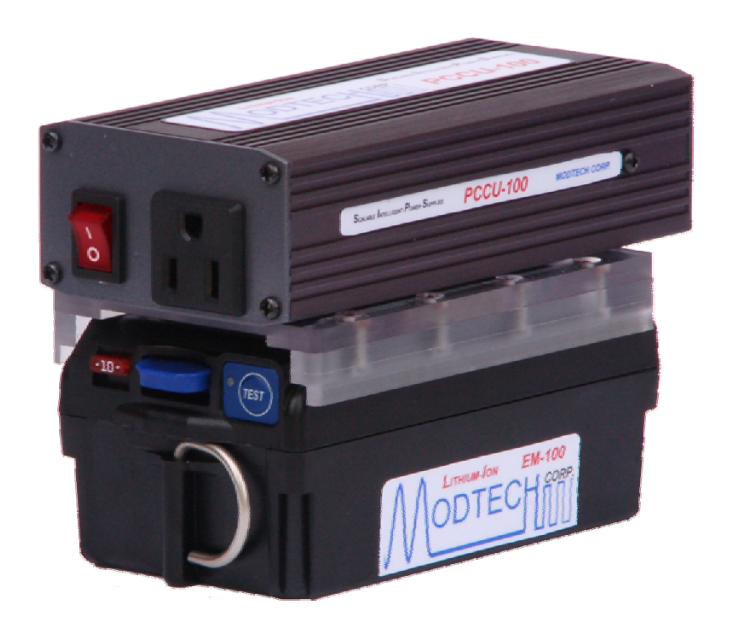
PCCU-100 Inverter with EM-100 Lithium Ion Battery Pack